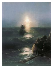
Walking on Water, by Ivan Aivazovsky (1888) (Public Domain)